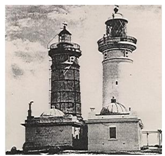
Original lighthouse on the left with the new lighthouse on the right in 1882.

The original Macquarie Lighthouse on Sydney's South Head was designed by Francis Greenway in 1818 but was reconstructed on the same design in 1883. The lighthouse is symmetrical in design with the main construction material being sandstone with an approximately 2 metre sixteen sided dioptric holophotal revolving white light. The lighthouse is 85 metres above sea level and 26 metres high.