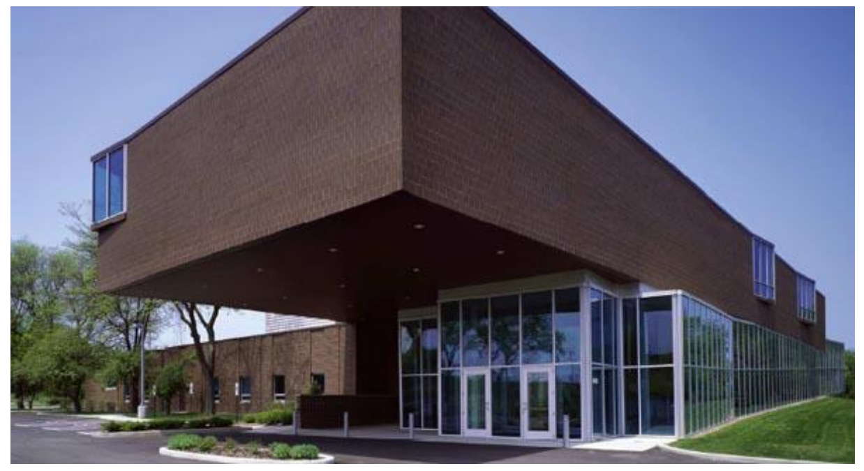
Figure 1.3 – Cantilevered Building, U.S.A.

The 18 metre cantilever over the main entry and drop-off provides shelter and an ascetic effect. The cantilever perches on a solid mass above a transparent, glass box instead of the opposite by treating the whole upper floor as a truss.