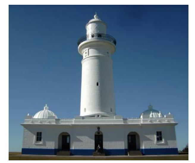
Recent image of the lighthouse 2010