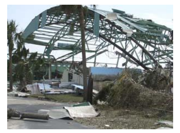
Figure 1.4 shows the severe earthquake due sustained by buildings during the Christchurch earthquake, while Figure 1.5 the damage to railway tracks causes by the lateral movement of the earth during the quake.

The building in Figure 1.6 sustained major damage to the structure due to excessively high wind velocities creating loads which the individual members were never designed to transmit due to the structural members alternating between tensile, compressive and torsional stresses.