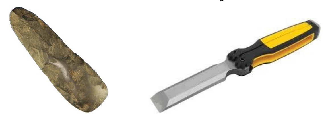
Figure 1.1 Figure 1.2

The earliest form of the chisel began to appear around 8,000 BCE, and it was made out of flint, rather than any metal. Archaeological sites have uncovered numerous examples of early chisels (Figure 1.1), along with evidence of their use. Much like modern chisels (Figure 1.2), ancient chisels could be used independently or in combination with a hammer or mallet which drives the chisel into the material being worked.