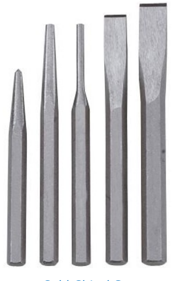
Cold Chisel Set

Unlike a woodworking chisel, a cold chisel tends to be darker in colour and may not have a handle. Technically there are four main types of cold chisel: those that are equipped with a diamond-shaped point for making sharp cuts or punching holes; those that have a cross-cut head for making slots or grooves; those that have a rounded blade for making indentations; and those that have a flat, wide cutting head. The most common type of this chisel is the flat chisel.