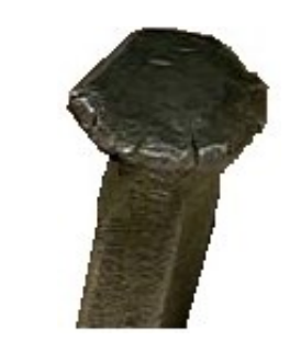
Figure 1.13 - Burred End